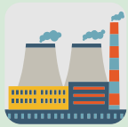
Thermal Power Plants